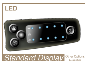
Standard Display Other Options Available

Bike Weight 21.46 kg Total with Eco Batt. 24.06